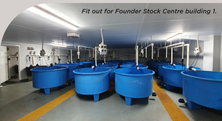
Fit out for Founder Stock Centre building 1.

Seafarms agreed to start the planning work early to ensure more effective implementation of the program once construction starts. Recruitment of the Ranger Coordinator is underway.