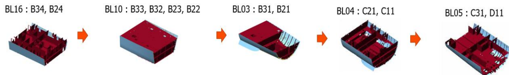
Figure 2. Prototyping Blocks Diagram

The strategy of Prototyping is to progressively establish, install and test the production system, develop the facilities, workforce, processes and systems, in order to provide confidence that the whole enterprise is ready to commence Ship Construction and de-risk the HCFP.