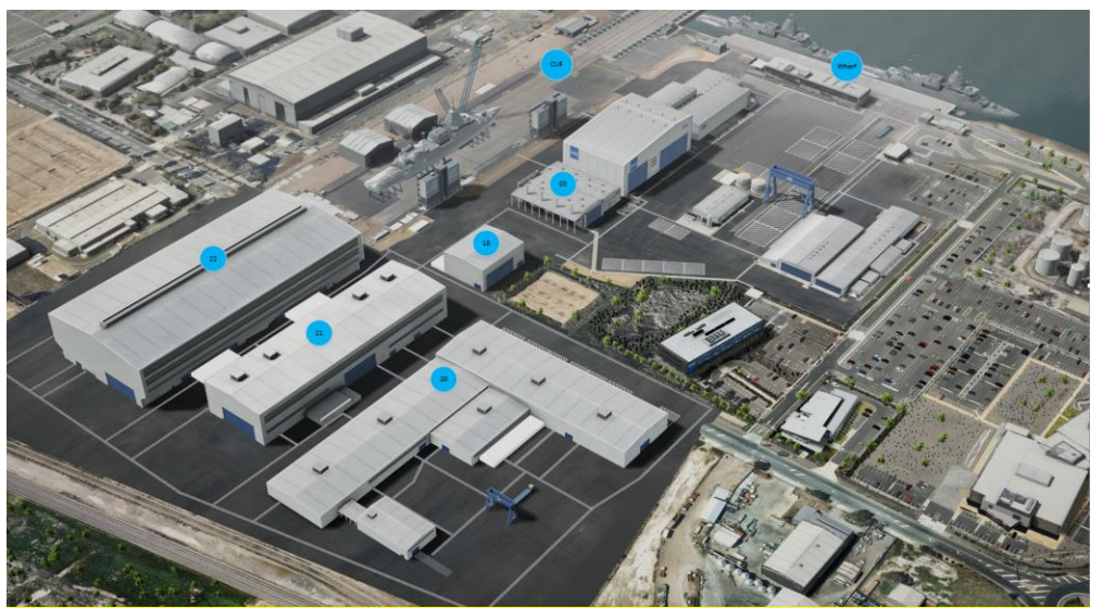
Figure 5. The Osborne Naval Shipyard