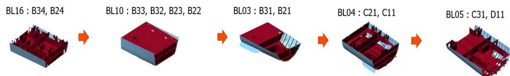
Figure 1. Prototyping Blocks Diagram

Blocks: 10, 16, 03, 04 and 05. The total surface area for the five blocks combined is: approx. 29500m 2