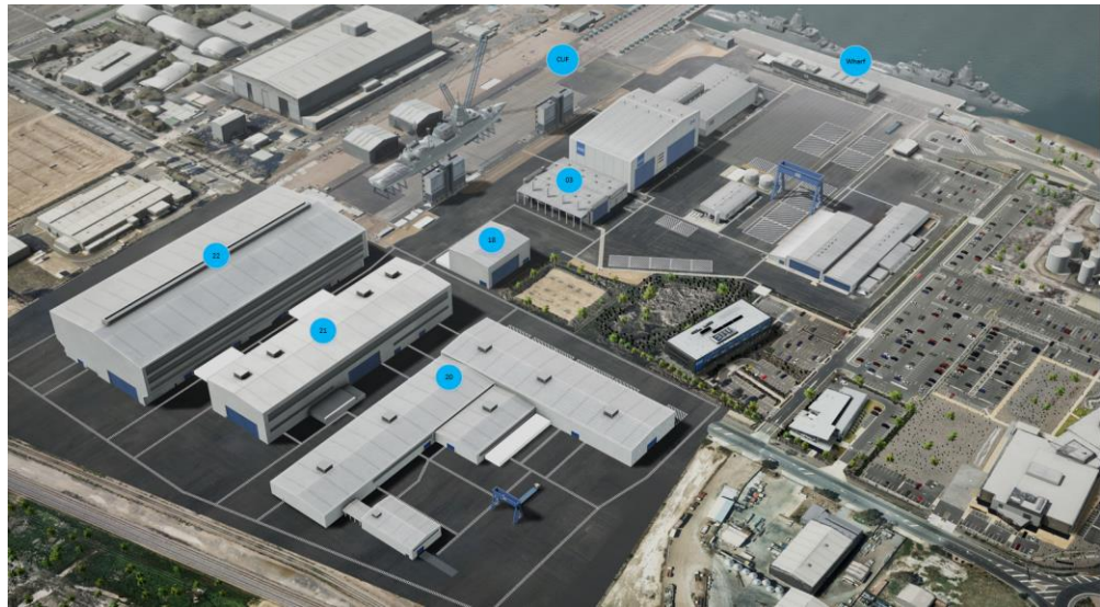
Figure 2. The Osborne Naval Shipyard